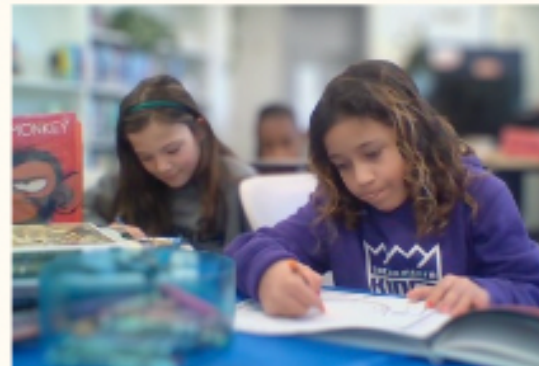
Students working on their book tasting activity